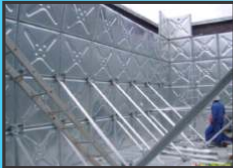
Internal bracing of tanks