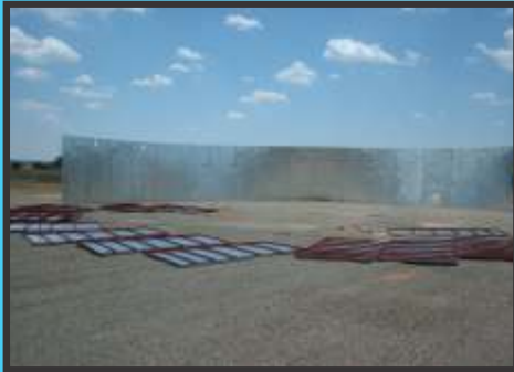
Panel reservoir erected on prepared soil