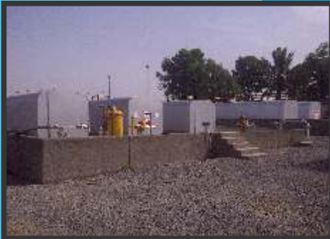
Fuel off-loading points