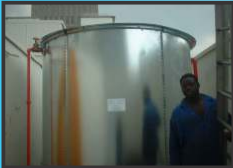
15KL Sectional Tank