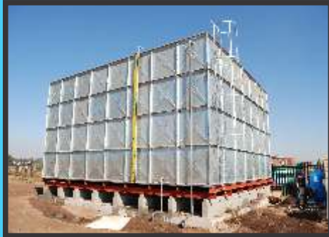
Ground level tank on suitably prepared foundations