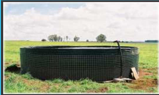
Suitable for use in agriculture