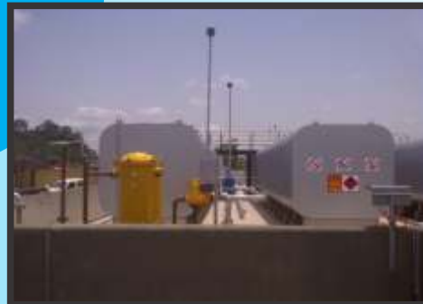
Fuel pumps and pipe work