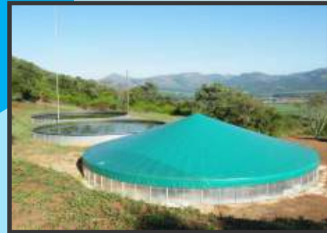
Panel reservoir used in agriculture