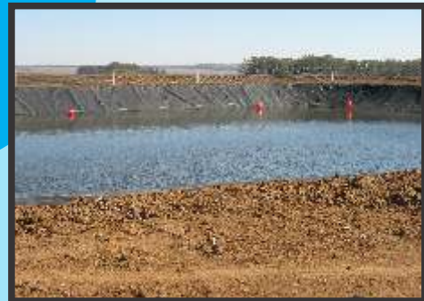
Completed dam filled with water