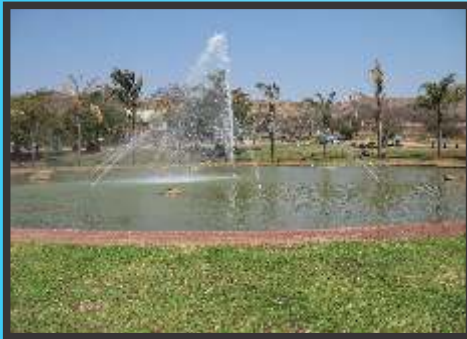
HDPE Lined ornamental pond.