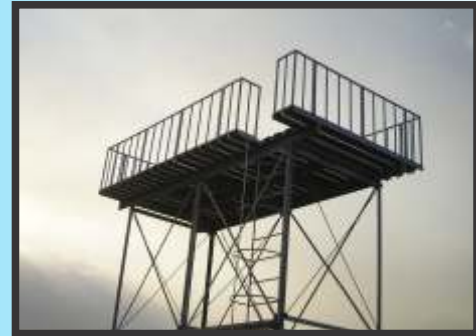
20KL Stand with railing