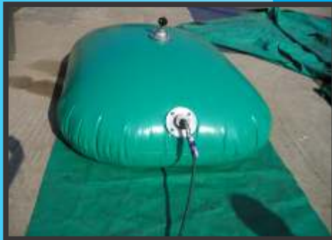
Diesel / Fuel Tanks.