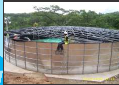
Panel reservoir with metal roof structure