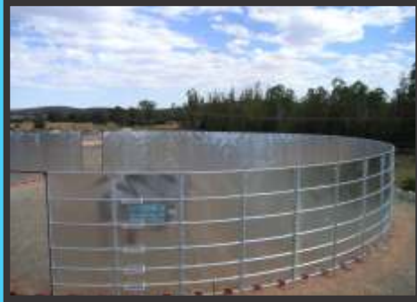
Panels mounted on compacted soil and foot plates.