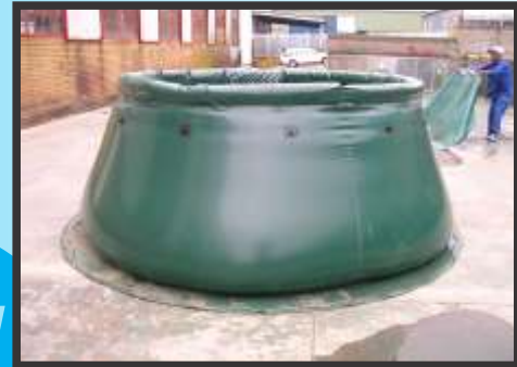
KL S Tank