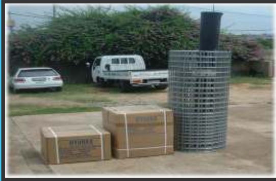
Mesh reservoirs are compact and easy to transport.