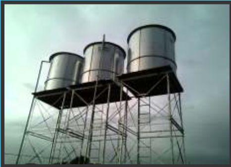
10KL Sectional tanks on 6 meter stands