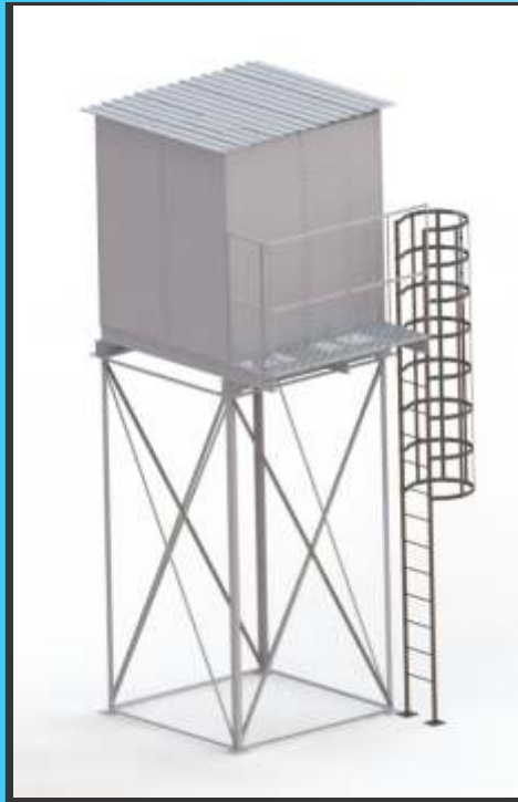
12KL Sectional Bolt Together tank on 4 meter stand. No liner required