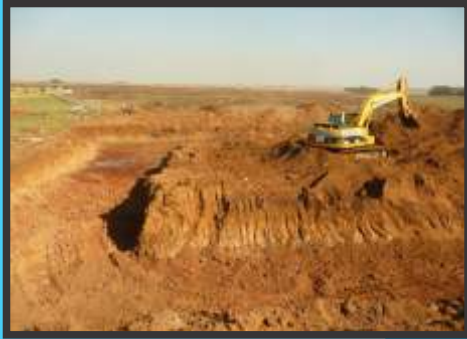
Excavation of earth dam