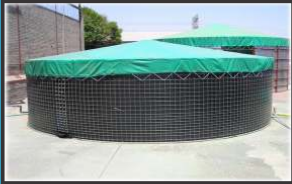
Mesh reservoir fitted with tarpaulin roof.