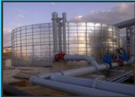
Process water and piping