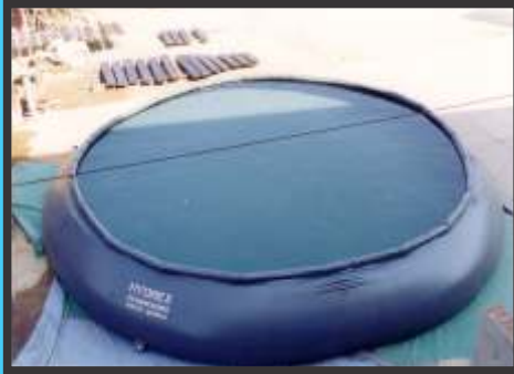
S-Tank or Onion Tank.