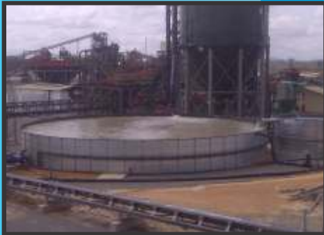
Process water reservoir