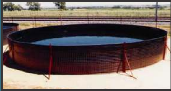
12 Meter Ø reservoir - 172KLØ - fitted with supporting stays