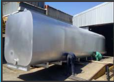
Diesel / Fuel Tanks.