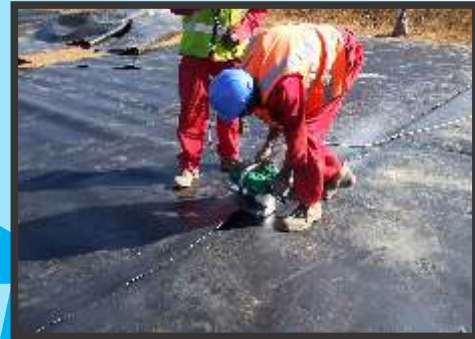
Welding of HDPE in earth dam