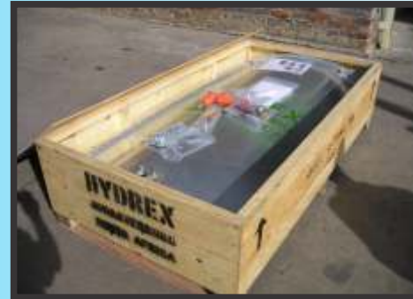
Crated tank components