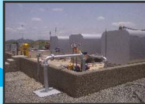
Diesel Farm Installation