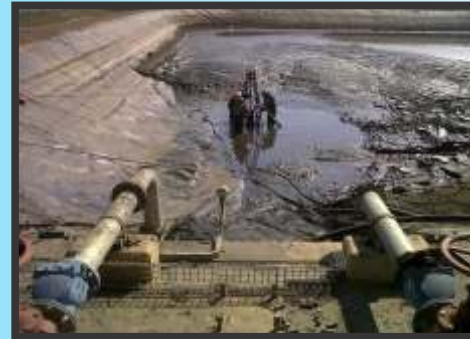
Cleaning of contaminated earth dams

Dam cleaning, rehabilitation and re lining.