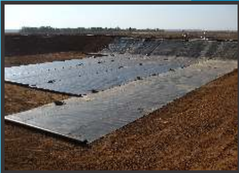
Excavated earth dam with lining