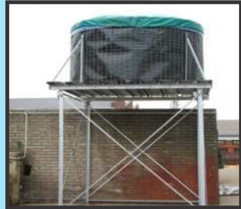
5KL Mesh tank on 3 meter stand.